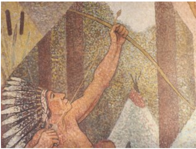
Detail of the archer, near the bottom of the piece.