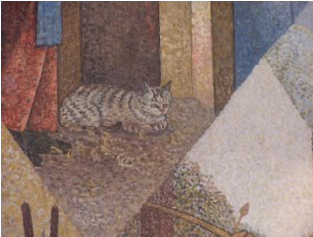
Detail of the cat, which I didn't even know was on the mural because of the grime.