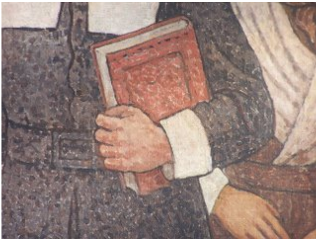
Detail of a book, which is appropriate don't you think?