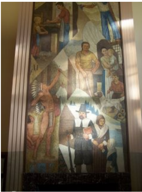
The finished, repaired, and varnished mural in the morning sunlight.